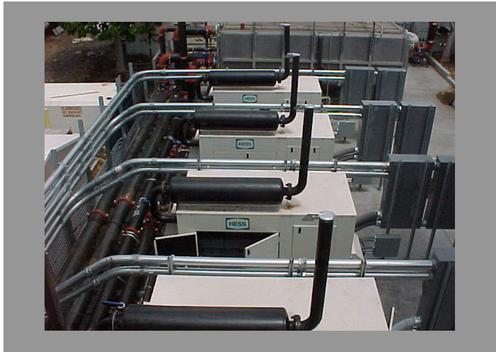
Figure 9-3. Propane-fueled generators at The Orchid at Mauna Lani Hotel.

The Pohai Nani assisted living facility in Kaneohe uses one 100-kW propane engine generator (made by Hess Microgen) that provides heat for two 10-ton absorption chillers, domestic hot water and a swimming pool.