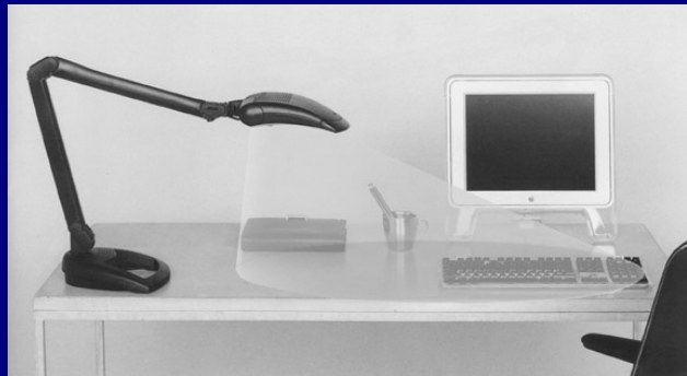
Prototype LED Task Light

IN ADDITION TO THE ENERGY PERFORMANCE, THE FIXTURE USES A CONSUMER FRIENDLY DESIGN TO SPEED MARKET ACCEPTANCE.