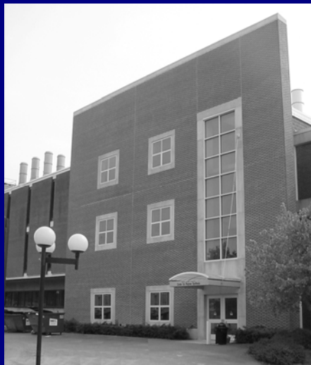
Field study site: Empire State Hall at Rensselaer Polytechnic Institute.

THE LIGHTING RESEARCH CENTER INSTALLED PROTOTYPE LED ELEVATOR DOWNLIGHTS THAT PROVIDED SIMILAR ILLUMINATION LEVELS COMPARED TO INCANDESCENT FIXTURES WHILE CUTTING ENERGY USE 45%. ELEVATOR PASSENGERS FOUND THE LIGHTING TO BE ATTRACTIVE, STYLISH, BRIGHT, MODERN, COMFORTABLE, AND CLEAN-LOOKING.