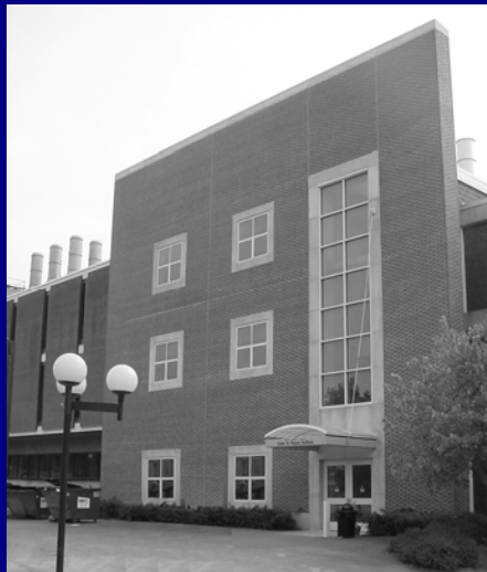
Field study site: Empire State Hall at Rensselaer Polytechnic Institute.

THE LIGHTING RESEARCH CENTER INSTALLED PROTOTYPE LED ELEVATOR DOWNLIGHTS THAT PROVIDED SIMILAR ILLUMINATION LEVELS COMPARED TO INCANDESCENT FIXTURES WHILE CUTTING ENERGY USE 45%. ELEVATOR PASSENGERS FOUND THE LIGHTING TO BE ATTRACTIVE, STYLISH, BRIGHT, MODERN, COMFORTABLE, AND CLEAN-LOOKING.