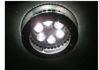
LED Elevator Downlight