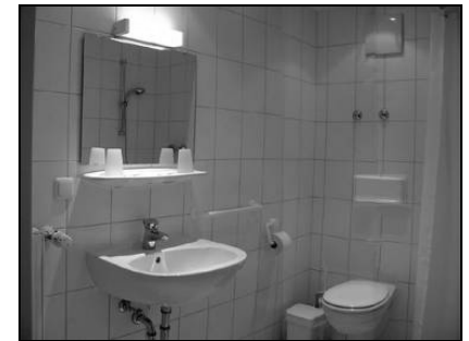
The luminaire is being installed and tested in hotels and assisted living facilities.

The CLTC staff worked closely with the Sacramento Municipal Utility District (SMUD), SpecLight, and hospitality partners to develop a novel luminaire that cuts energy use by about 50% while improving occupant satisfaction. Payback is expected to be 2-6 years, depending on the application in which it is installed.