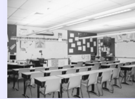
The pre-retrofit classroom system is shown on the left with lensed troffers. The new ICLS system is shown on the right.